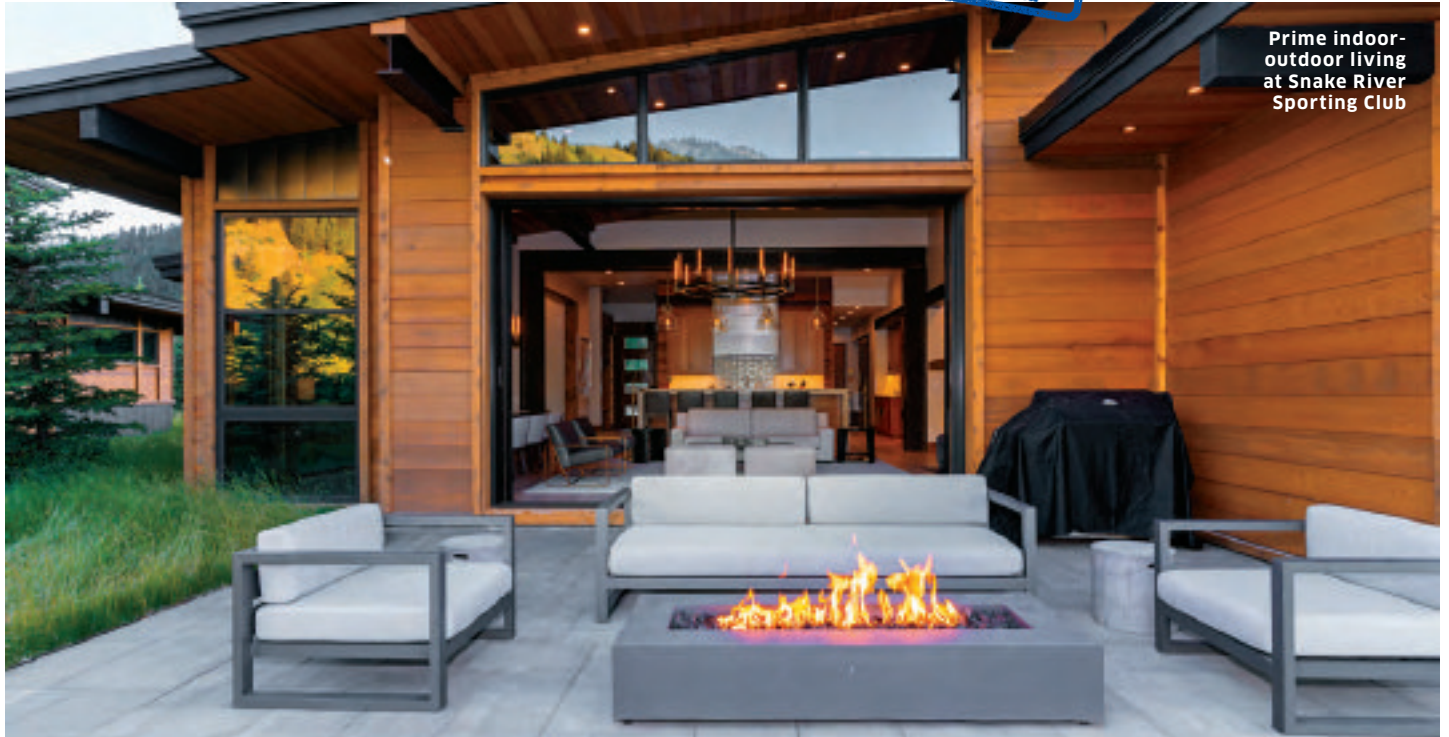
Prime indoor-outdoor living at Snake River Sporting Club